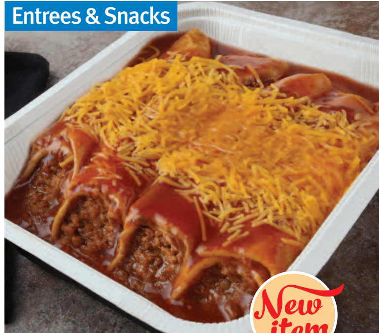
Entrees & Snacks