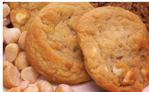
465 WHITE CHOCOLATE MACADAMIA NUT