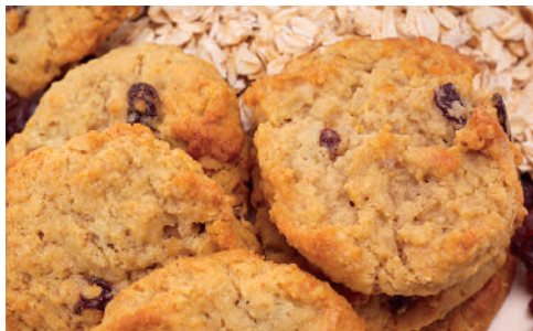
462 OATMEAL RAISIN AVENA Y PASAS