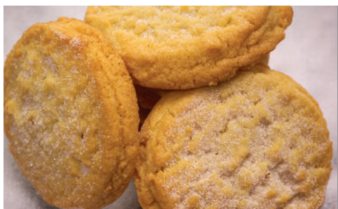
466 SUGAR AZÚCAR