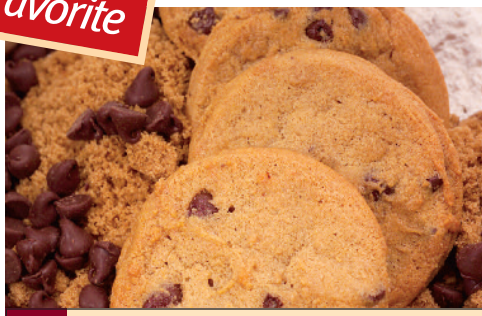
460 CHOCOLATE CHIP CHISPAS DE CHOCOLATE

The taste of homemade without the messy kitchen. Dough is preportioned. Zero grams of trans fat per serving.