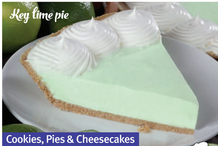
Key lime pie