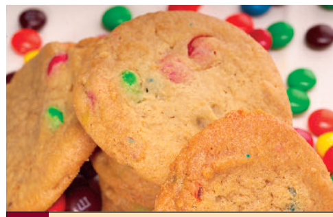
461 M&M® CANDY DULCES M&M®