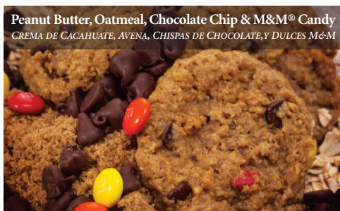
467 MONSTER COOKIES GALLETAS MONTRUO Peanut Butter, Oatmeal, Chocolate Chip & M&M® Candy CREMA DE CACAHUATE, AVENA, CHISPAS DE CHOCOLATE, Y DULCES M&M