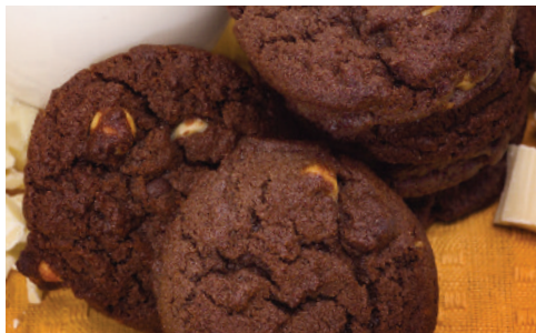
464 TRIPLE CHOCOLATE