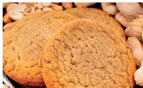
468 PEANUT BUTTER CREMA DE CACAHUATE