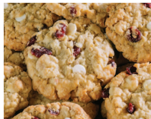
469 CRANBERRY WHITE CHOC. OATMEAL

Peanut Butter, Oatmeal, Chocolate Chip & M&M® Candy CREMA DE CACAHUATE, AVENA, CHISPAS DE CHOCOLATE, Y DULCES M&M