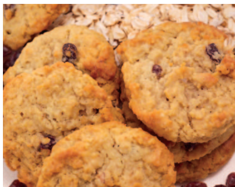
462 OATMEAL RAISIN AVENA Y PASAS