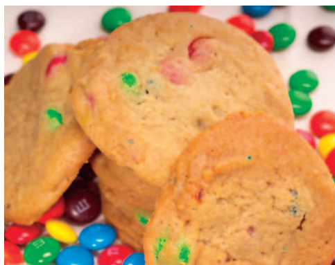
461 M&M® CANDY DULCES M&M®