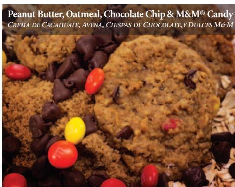
467 MONSTER COOKIES GALLETAS MONTRUO

Peanut Butter, Oatmeal, Chocolate Chip & M&M® Candy CREMA DE CACAHUATE, AVENA, CHISPAS DE CHOCOLATE, Y DULCES M&M