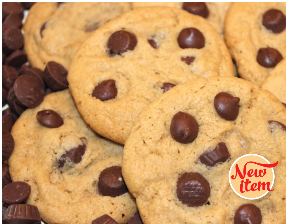
470 PEANUT BUTTER CUP TAZA DE MANTEQUILLA DE MANI