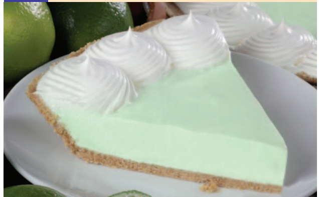
524 KEY LIME 31 OUNCES

PASTEL DE BARRA DE CARAMELO CON BUTTERFINGER® 34.5 OZ