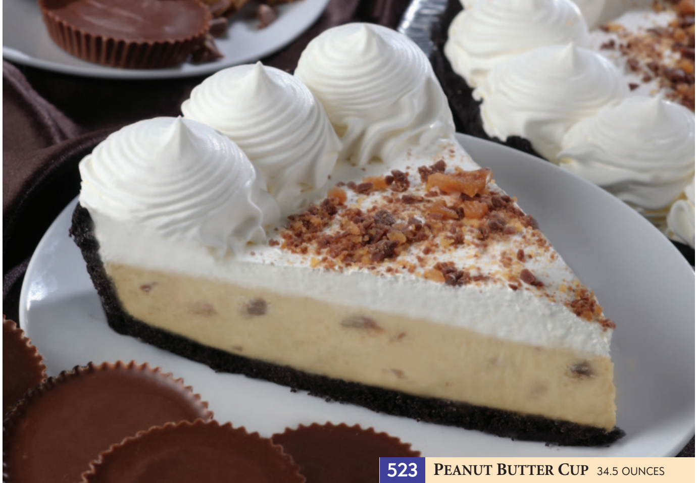
523 PEANUT BUTTER CUP 34.5 OUNCES

CREMA DE CACAHUATE CON CHISPAS DE CHOCOLATE