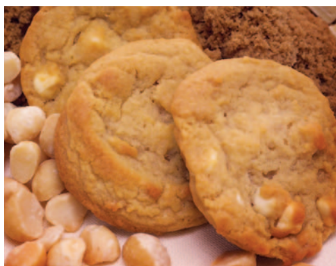
465 WHITE CHOCOLATE MACADAMIA NUT