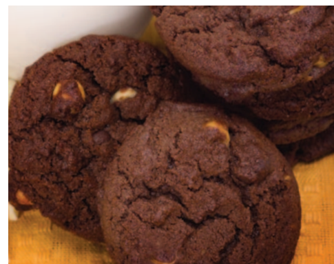
464 TRIPLE CHOCOLATE