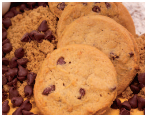
460 CHOCOLATE CHIP CHISPAS DE CHOCOLATE

The taste of homemade without the messy kitchen. Dough is preportioned. Zero grams of trans fat per serving.